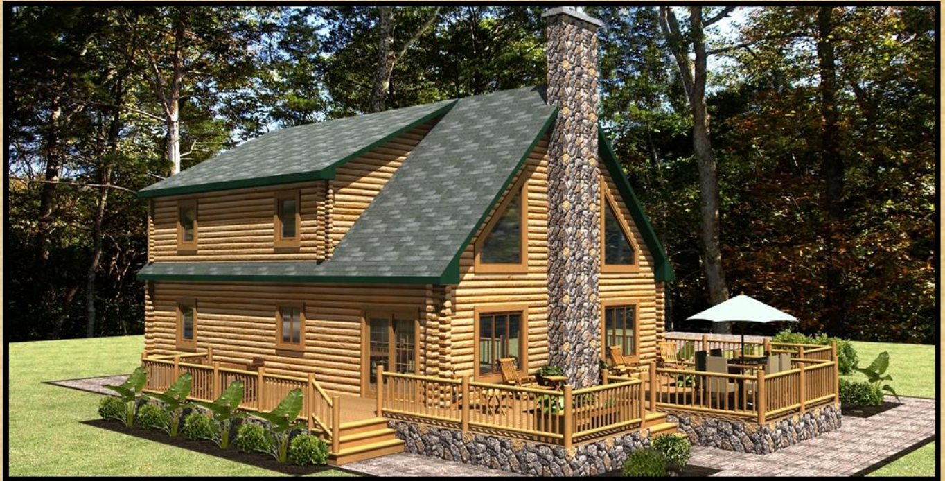
The Cornerbrook I ( 2112 Sq.Ft. )